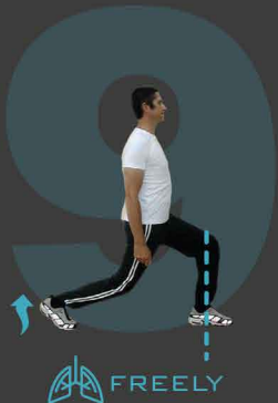
TIGHT ROPE BALANCE 20 SEC PER SIDE