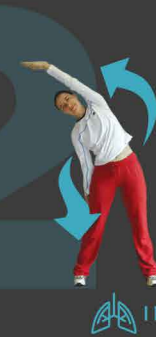
TILTING STAR 2X SLOWLY