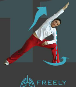
THE TRIANGLE TURN FOOT OUTWARD GENTLE STRETCH 10 SEC PER SIDE