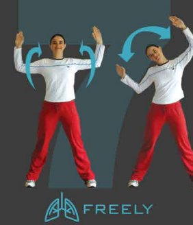
HUMMING BIRD DRAW SHOULDER BLADES TOGETHER CIRCLE SWAY 10 SEC