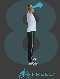
BUTTERFLY ELBOWS FORWARD PRESS HEAD BACK HOLD 3X