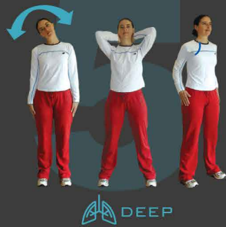
TRAP OPENER 1 RELAX HEAD SIDE TO SIDE 2 MASSAGE BACK OF NECK 3 ROLL SHOULDERS 1.5 SEC