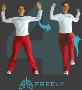
HANDS UP TWISTING STAR ALTERNATE 1.5 SEC