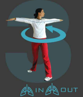
TWIRLING STAR REVERSE 2X