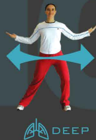
WASHING MACHINE GENTLY SWAY SIDE TO SIDE