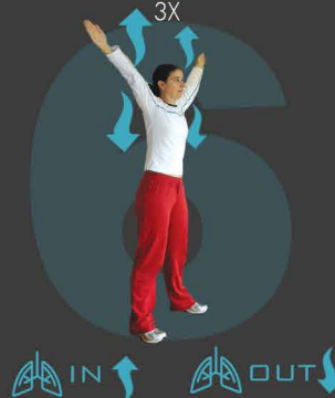
THE EAGLE DRAW SHOULDER BLADES TOGETHER 3X